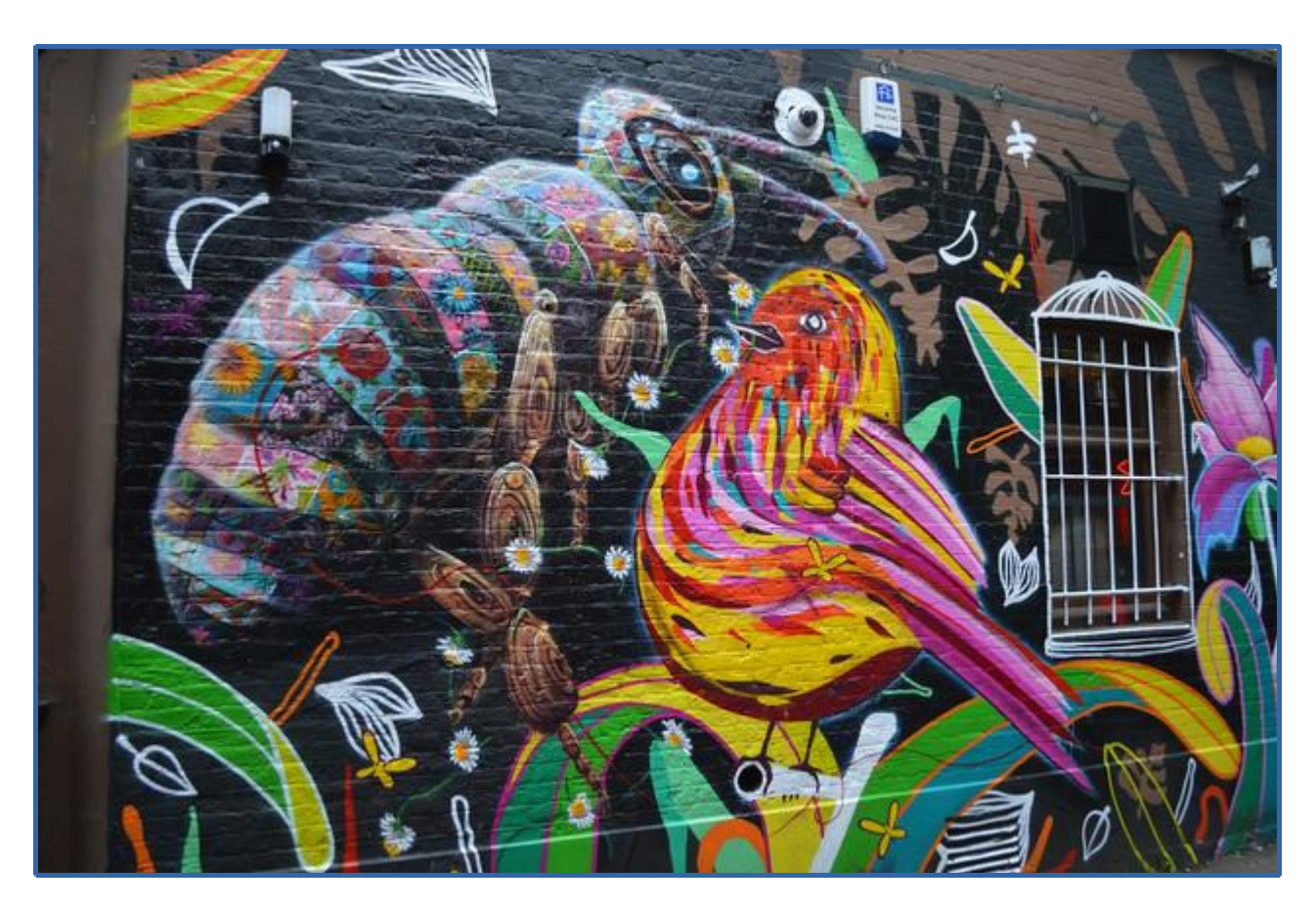
"Bee versus bird" by Matt From London

NRDC strongly supports the bill and you can too. If you live in New York, you can take action to make the Empire State a national leader in pollinator protection.