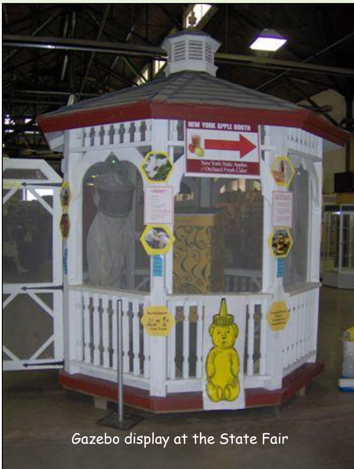
Gazebo display at the State Fair