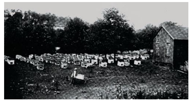
(I) An outyard of W.L. Coggshall, showing tenement hive used. Photo by Verne Morton (r) One of the outyards of W.L. Cogshall Photo by Verne Morton

of teenagers in a cramped shed, right there in the bee yard. These boys spun the honey from the frames and the fresh honey was run into wooden barrels. At the end of the day, the drums were loaded on to horse drawn wagons and taken back to the home base.