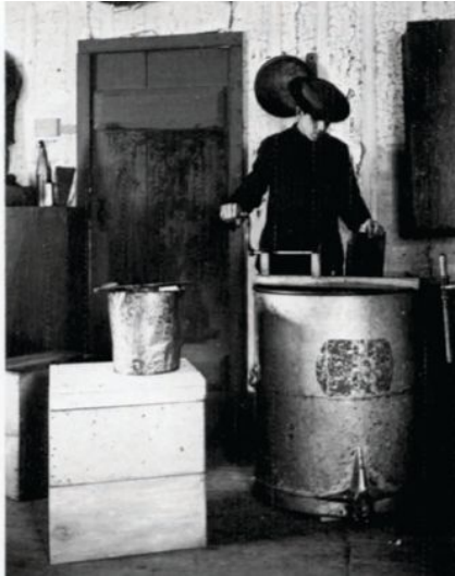
Scenes of the Coggshall method of extracting honey by hand.

not know exactly how many." These were placed in fifteen different locations between Cayuga Lake and Skaneateles. The home base was in Groton, NY.