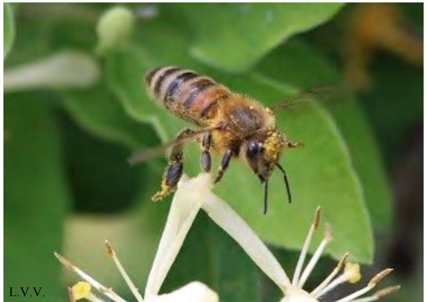
So Much Pollen and So Little Time - No Time to Pack Those Pollen Baskets on Autumn Olive