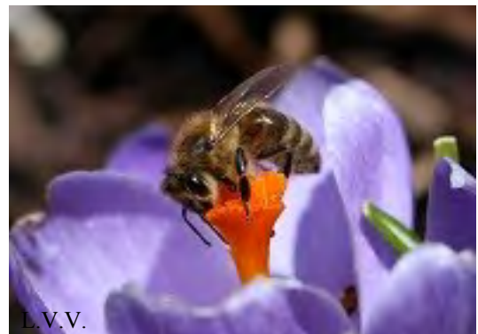
Balanced on a Crocus Pistil