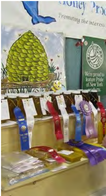
Ribbons at the 2013 State Fair