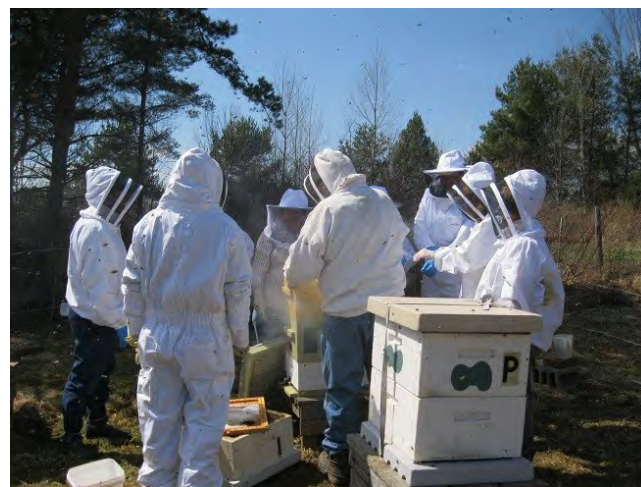
Southern Tier Beekeepers Association—"hands-on class"